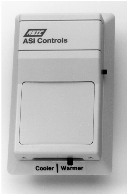
WS-RSO Wall Sensor